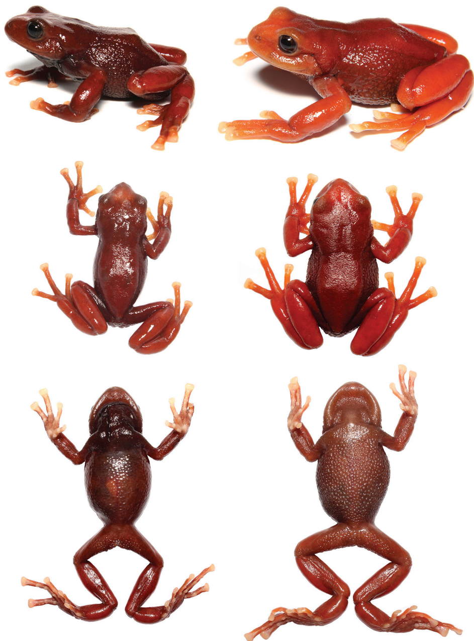
Figure 4. Lateral, dorsal and ventral views of living specimens of Pristimantis erythros . Left: Male paratype (DHMECN 12102, SVL: 37.1 mm); right: Female holotype (DHMECN 12103, SVL: 39.1 mm).

covered by small and pronounced warts (Fig. 2). Ulnar warts slow, radioulnar macrogland covering dorsal surface of arm, forearm and hand; palmar tubercles large, external palmar tubercle, slightly larger than inner, inner palmar tubercle oval; super-