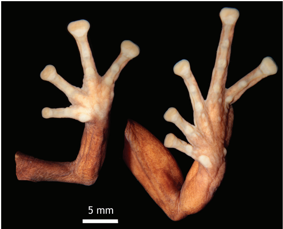
Figure 3. Detail of ventral view of hand and foot of the holotype of Pristimantis erythros sp. n. (DHMECN 12103).

presence of dentigerous processes of vomer, dark canthal, tympanic marks, and green or brown color with large black spots on the flanks; it inhabits paramos in the southern section of Cordillera Oriental of the Andes of Ecuador. Pristimantis loujosti differs by its subacuminate snout in dorsal view, large dentigerous processes of vomers, light orange dorsum, black spots on hidden surfaces of limbs, and light iris with dark reticulation.