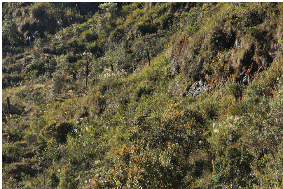
Figure 6. Habitat of Pristimantis erythros in type locality.