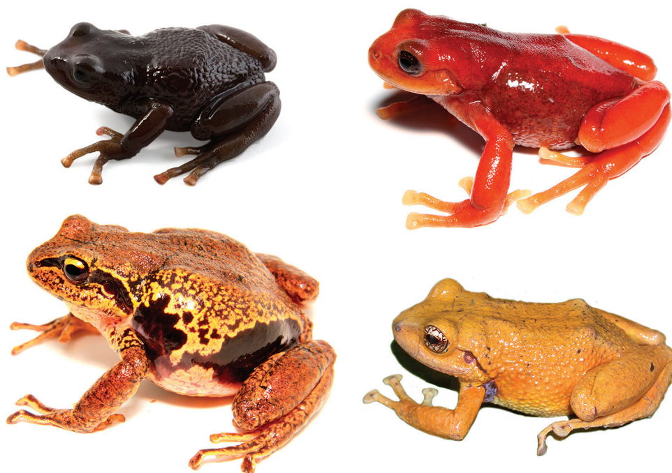
Figure 5. Comparison of Pristimantis erythros (top right) with Pristimantis orcesi (top left), Pristimantis pycnodermis (below left), and Pristimantis loujosti (below right).