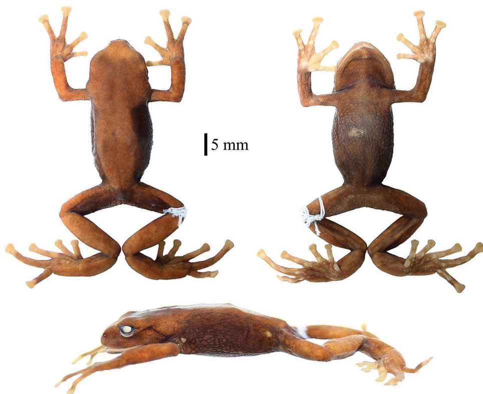
Figure 2. Dorsal, ventral and lateral views of holotype of Pristimantis erythros sp. n. (adult female, DH-MECN 12103, SVL 39.1 mm) in preservative.

extend to base of fingers, webbing absent; toe pads as large as or slight larger than those on fingers; (13) in life, dorsum uniformly burgundy, red to orange-red (reddish brown to burgundy in preserved); flanks, posterior surfaces of legs, groin, throat and venter crimson (dark reddish brown in preserved); iris dark brown with thin golden reticulations; ventral surfaces of hands and feet pinkish cream; (14) SVL in adult females 38.8–42.6 mm ( \bar{x} = 40.3, n = 4), in adult males 36.8–37.1 mm ( \bar{x} = 36.7, n = 2).