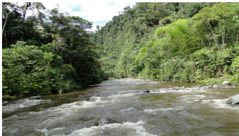
Figure 2. View of Jurumbuno river (1,300 m), habitat of Ichthyomys stolzmanni in Ecuador.

The reference specimen was deposited in the Mastozoology Division of the Museo Ecuatoriano de Ciencias Naturales, Quito, Ecuador (DMMECN 4,914), from which the skull was removed and cleaned with dermestid larvae; the body was preserved in 75 % alcohol. Cranial measures were taken with a digital gauge to the nearest 0.1 mm. The measures, body and cranial features were recorded following Voss (1988) . Food items in the stomach contents were identified with a magnifying glass (Leica EZ4HD) at 35x.