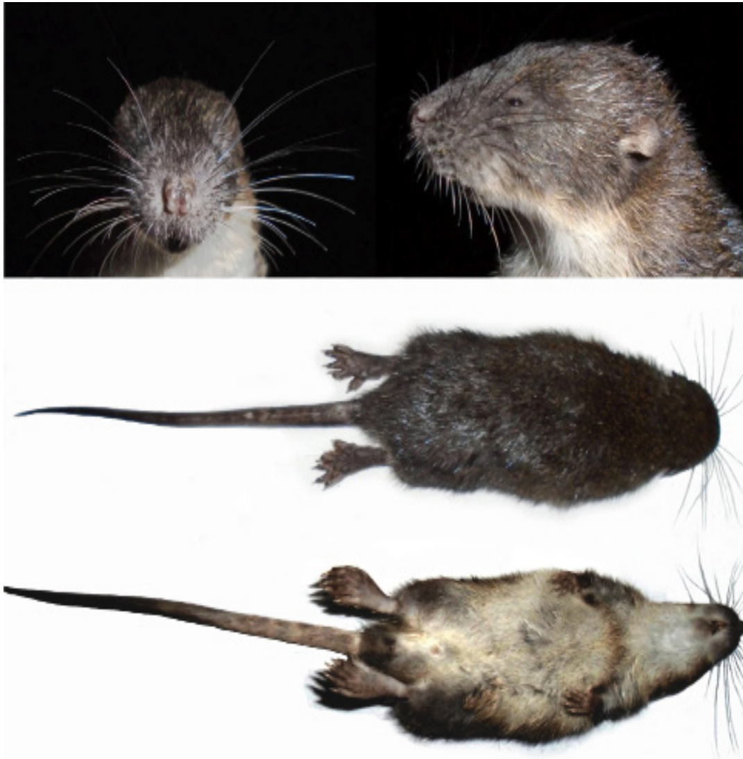
Figure 4. Front and lateral (above), dorsal (center) and ventral (bottom) view of the head of Ichthyomys stolzmanni (DMMECN 4,914); head-body length 160 mm.

The front leg is medium-sized and thin; it has five fingers with claws, with the thumb being shortened with a short and rounded claw. The remaining fingers are relatively short, with enlarged and curved claws. Tufts of nail hairs cover 40 % of the claws in the hands. The metacarpal region is whitish with long dark brown hairs. The palmar surface shows five pads: the thenar and hypothenar pads are enlarged and separated by a small space; the three interdigital pads share a similar size, approximately 50 % of the thenar pad size (Figure 5).