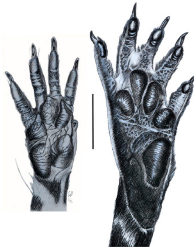
Figure 5. Palmar view of the right front leg (left) and plantar view of the right hind leg (right) of Ichthyomys stolzmanni (DMMECN 4,914). Bar = 10 mm.