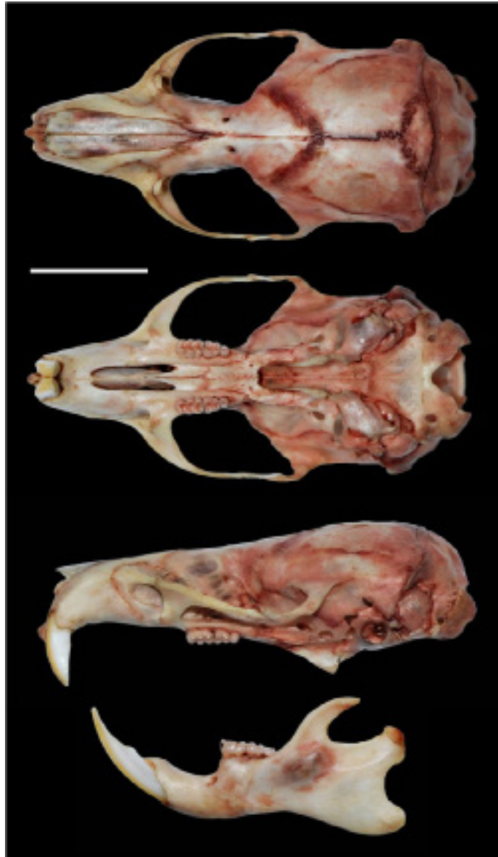
Figure 3. Dorsal (above), ventral (center) and lateral (bottom) view of the skull of Ichthyomys stolzmanni (DMMECN 4,914). Bar = 10 mm.

The main body and cranial measures of the I. stolzmanni specimen from the Jurumbuno river (Table 1) are within the range known for the species (Voss 1988; Pacheco and Ugarte-Núñez 2011). The specimen DMMECN 4,914 shows a narrow skull and interorbital region, with obvious supraorbital foramen, carotid circulation pattern 3 ( sensu Voss 1988), presence of the orbicular apophysis of the malleus (Figure 3) and leg longer than 39.0 mm, all of which being diagnostic characters for this species (Voss 1988, 2015).