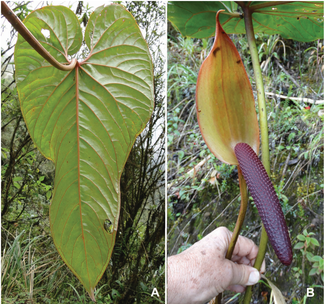
FIGURE 3. Anthurium yanacochense Croat, C.Ulloa & E.Freire. A. Leaf blade abaxial surface showing 5–7 pairs of basal veins, prominent posterior lobes and concave margin. B. Inflorescence showing erect greenish spathe and spreading purple-violet fusiform spadix.