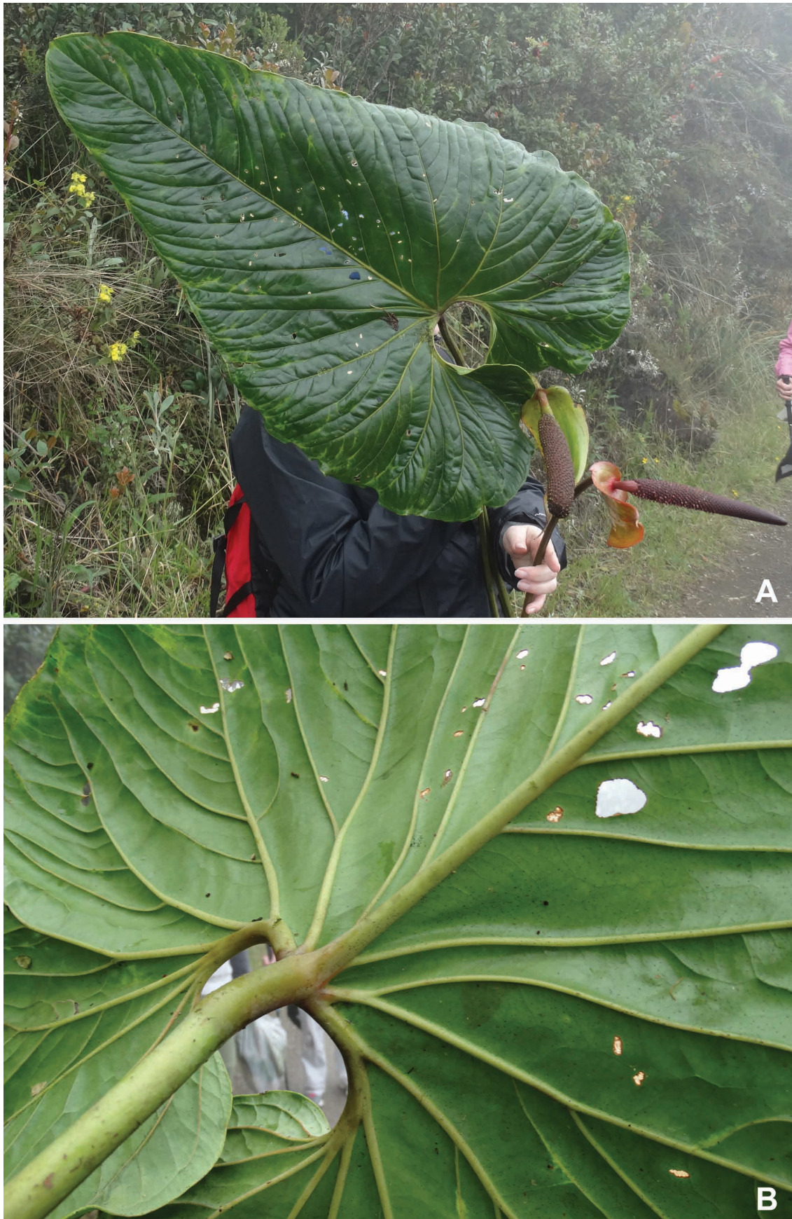
FIGURE 2. Anthurium yanacochense Croat, C.Ulloa & E.Freire. A. Leaf blade adaxial side. B. Leaf blade abaxial side showing 9 basal veins and posterior rib.