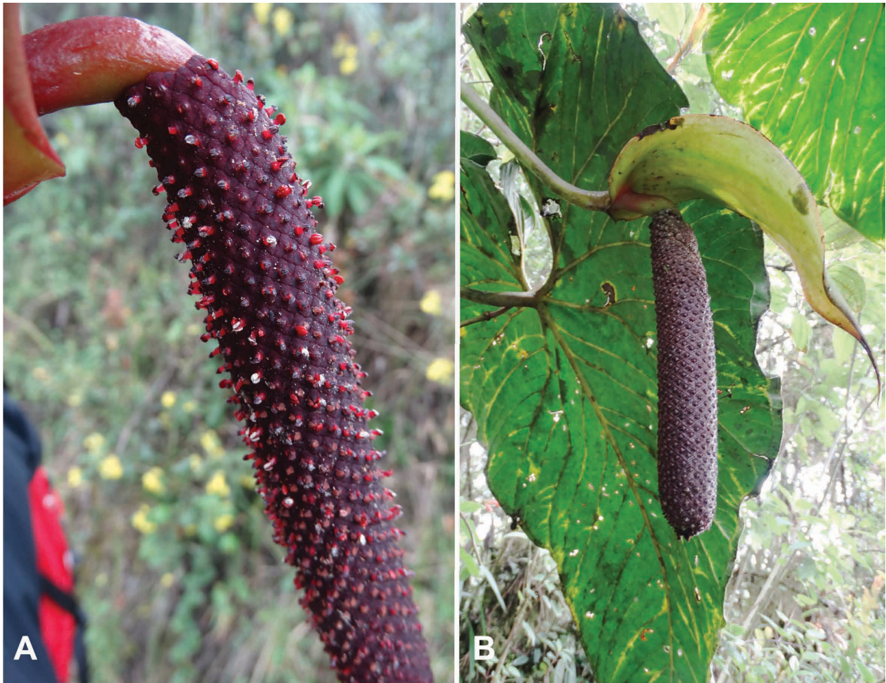
FIGURE 4. Anthurium yanacochense Croat, C.Ulloa & E.Freire. A. Inflorescence showing close-up of flowers with exserted red stamens. B. Habit of infructescence with leaf abaxial surface.