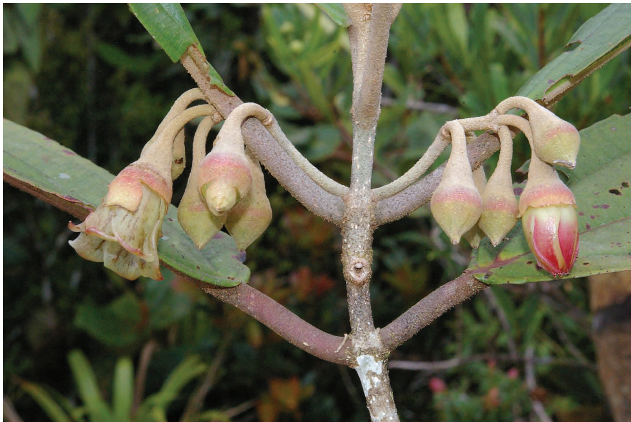
FIGURE 2. Inflorescences of Chalybea brevipedunculata (Neill 16913).

described from the same two localities in recent years, including Miconia machinazana C. Ulloa & D.A. Neill (2012: 36) (Melastomataceae), Clethra concordia D.A. Neill, H. Beltrán & Quizhpe (2012: 213) (Clethraceae), Weinmannia condorensis Z.S. Rogers (2002: 183) (Cunoniaceae), Ocotea limiticola van der Werff (2014: 360) (Lauraceae) and Lissocarpa ronliesneri B. Wallnöfer (2004: 552) (Ebenaceae).